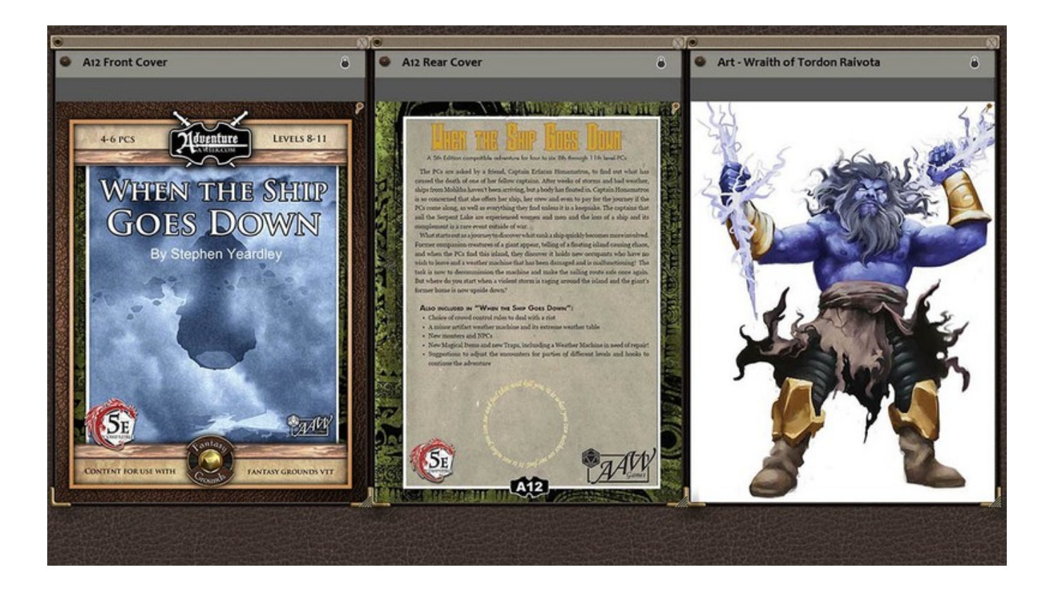
Fantasy Grounds - A12: When The Ship Goes Down (5E) Full Crack [hack]